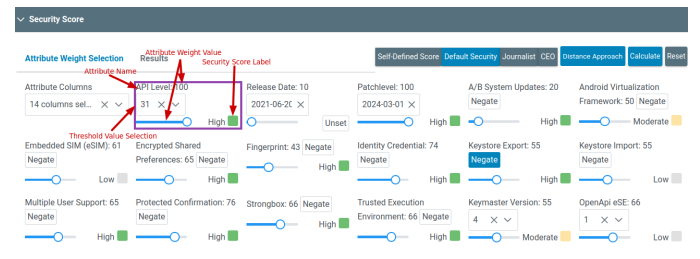
(a) Interface for defining the "Default Security" score in the frontend. It shows the name, threshold value, security score level, and weighting for each attribute.

We developed a domain-specific query language (DSQL) to access a defined view on the collected data. The frontend website encodes its state and selections within the URL which allows for reproducible queries and pre-defined settings. Direct access via the documented API requests introduce the possibility to integrate the data in other applications to be used for security checks and decisionmaking. Based on the data type of attributes, different operations can be applied with the filtering and attribute selection for the security score calculation.